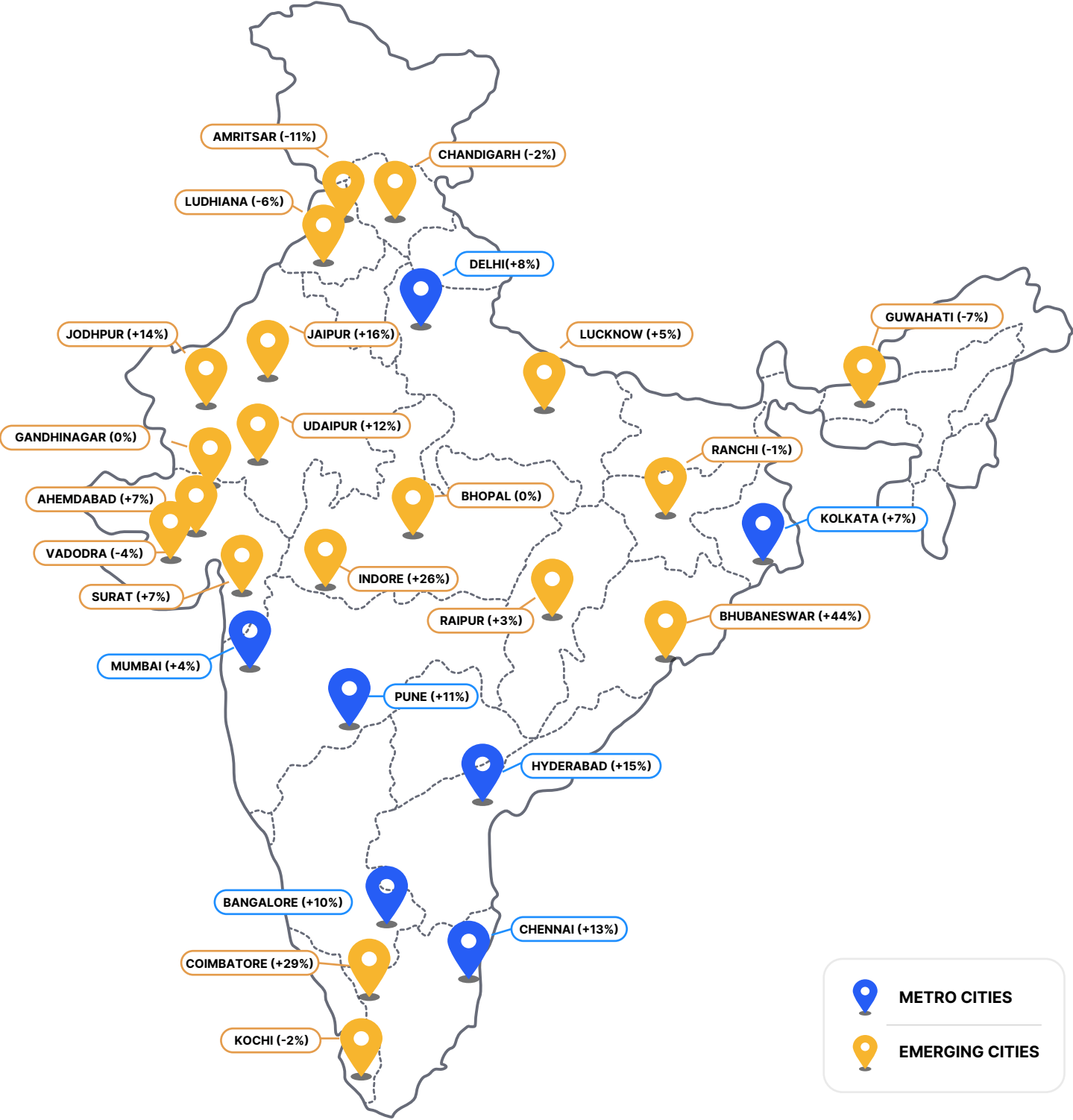
Growth Trends: Dec'24 vs Dec'23

While Chennai (+35%) and Bangalore (+21%) sustained their impressive growth, Coimbatore emerged as a standout, with fresher hiring growing by 14%, fueled by a 52% surge in foreign MNC hiring. Hyderabad also posted 15% growth, reflecting the region's sustained appeal for high-skill and fresher roles across sectors like IT, Consumer Durables, and Real Estate.